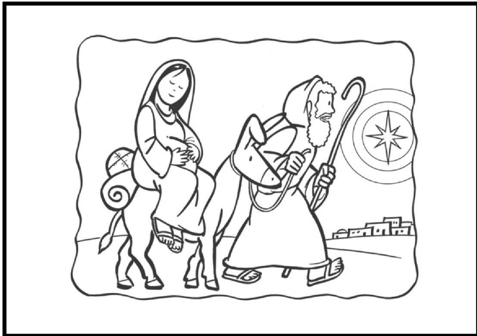
Colour in the Road to Bethlehem