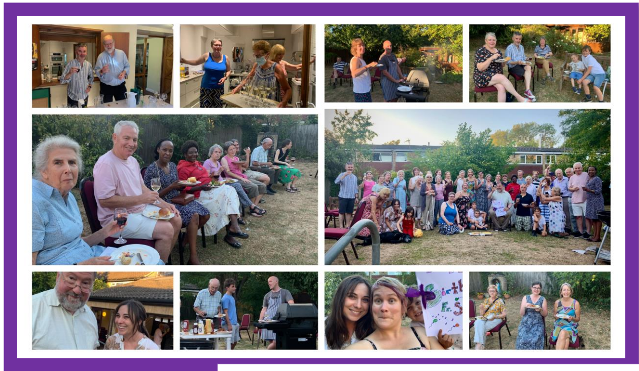
Celebrating St Laurence's Feast day 10 August 2022