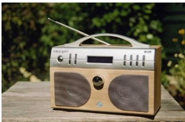
DAB RADIO AND IN YOUR CAR DAB+ - Radio Maria England (Band 12A 223.936 MHz) in Greater London DAB - Radio Maria England (Band 11C 220.332 MHz) in Cambridgeshire and the surrounding areas

You can listen to Radio Maria on their dedicated app from your phone's app store, online at www.RadioMariaEngland.uk or on DAB radio.