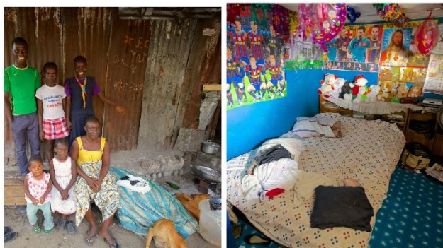
The Doe family lives in Liberia in a rented 3-bedroom house. Monthly income approximately £76. Their dream is to buy a car someday. (Middle-income category.)

For several decades now the living conditions of most people on Earth have been getting better. Most people have become less poor. Around 75% live in middle-income countries. (Global ‘middle-income’ is defined as living on between $2 and $32 a day.) People in those middle-income countries have largely the same range of living standards as people in Western Europe and North America had in the 1950s. The world has been getting better but our view of it generally hasn’t.