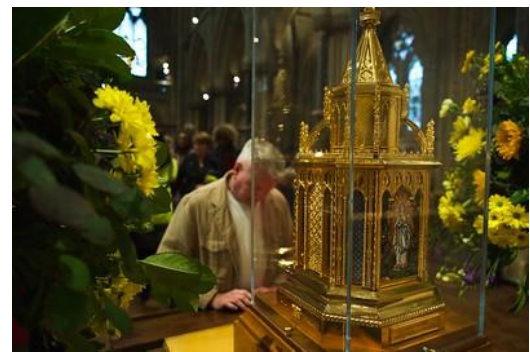
St Bernadette's reliquary at OLEM

The relics were in Cambridge for a full 24hrs filled with music, Masses and veneration including a Healing Mass and an all-night vigil before the relics continued on to the next stop on their journey.