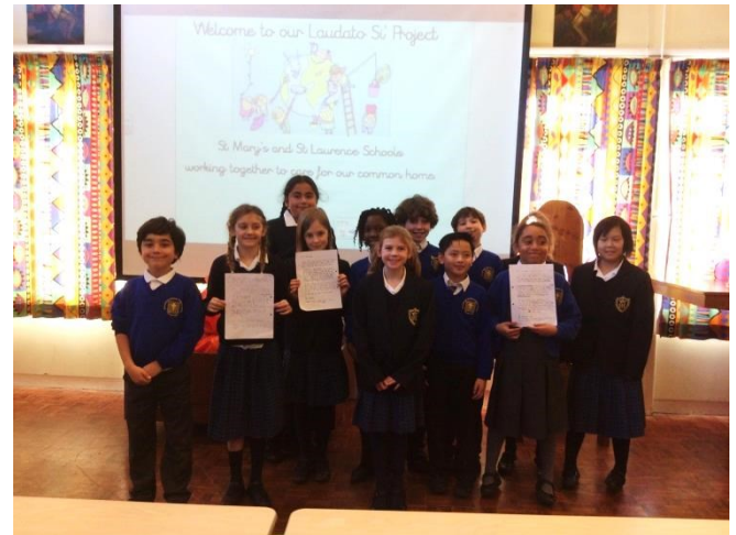
Pupils from St Laurence's & St Mary's show letters they have written

At the end of the school year I, as the school's CAFOD volunteer, will return to hear the results of their work. I will listen to messages of hope for refugees, hear about personal pledges and what has been discovered and done about 'Water and Waste' in each school. I will then present each school with a special Laudato Si' award so that the children can show everyone how they have answered Pope Francis' call to 'Live Wisely, Love Generously and Think Deeply'. There are also rumours of a LiveSimply picnic to celebrate!