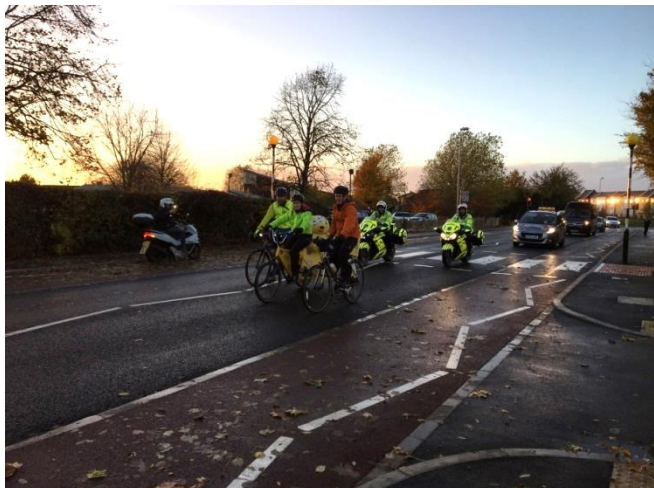
BBC Team Rickshaw Challenge passing the school

which they immediately gave to the young adults riding the rickshaw; the rest going into the whole school's total fundraising for Children in Need.