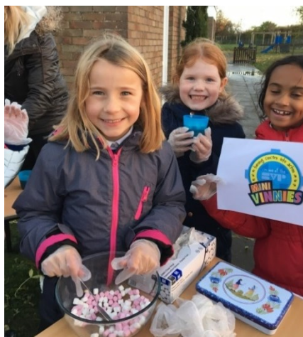
Mini Vinnies Fundraisers

The children's enthusiasm is contagious. Many members of staff at school and people in the Parish have approached me with ideas for what the 'Mini Vinnies' can do next. This is a great example of how our School and Parish work together and also makes a link between the Junior Vincentians and the important work of the Parish SVP.