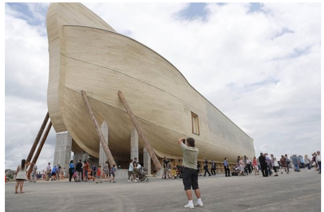
Visitors pass outside the front of a replica Noah's Ark at the Ark Encounter theme park, Williamstown, Kentucky

"Ark" is from the Latin arca , a box or chest, and the Hebrew word it translates, arōn , refers to the "Ark of the Covenant (or "testimony" here) i.e. the box which held the tablets of stone testifying to the Law. The Hebrew for Noah's Ark is a different word", tibāh , never used for anything except Noah's Ark. The word seems to mean a boat, perhaps borrowed from Egypt. A degree of muddle is introduced with the Greek translation, where the same word, kibōtos , a box or chest, is used for the Ark of the Covenant and for Noah's boat as well. The Greek New Testament follows them in a handful of places, and the Latin follows the Greek and translates both the covenant chest and Noah's boat by arca , a box. "Ark" then became the usual English for both, except in recent translations.