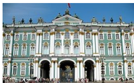
The Hermitage Museum

My main reason for choosing St Petersburg was its art and architecture but you could add history to that list as things transpired. The impressive Hermitage Museum, the Museum of Russia as well as a